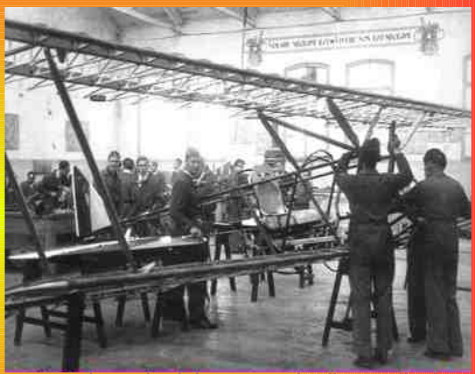
1939: lo scalo del montaggio di un velivolo biplano durante le esercitazioni di costruzioni aeronautiche.